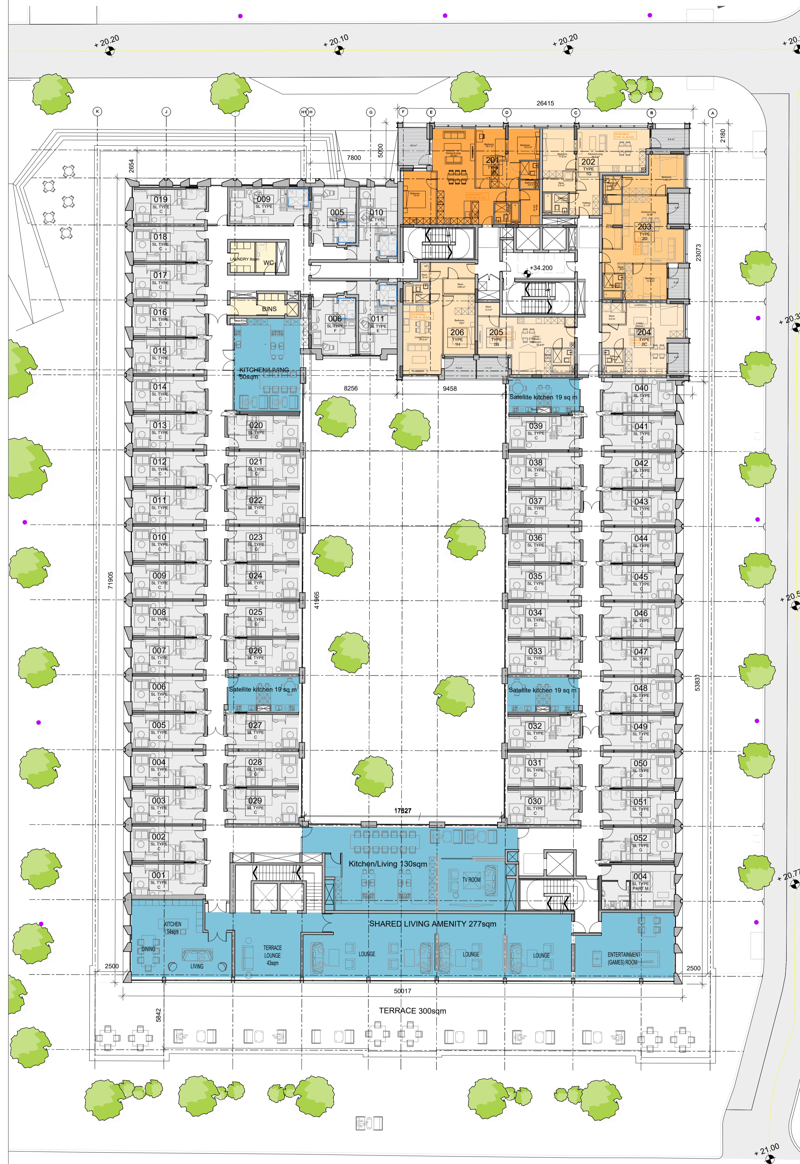
01 PW1 THIRD FLOOR PLAN PL1102 SCALE 1:200